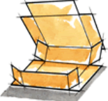
FIVE PANEL FOLDER